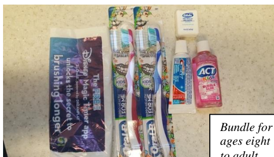
Bundle for ages eight to adult.