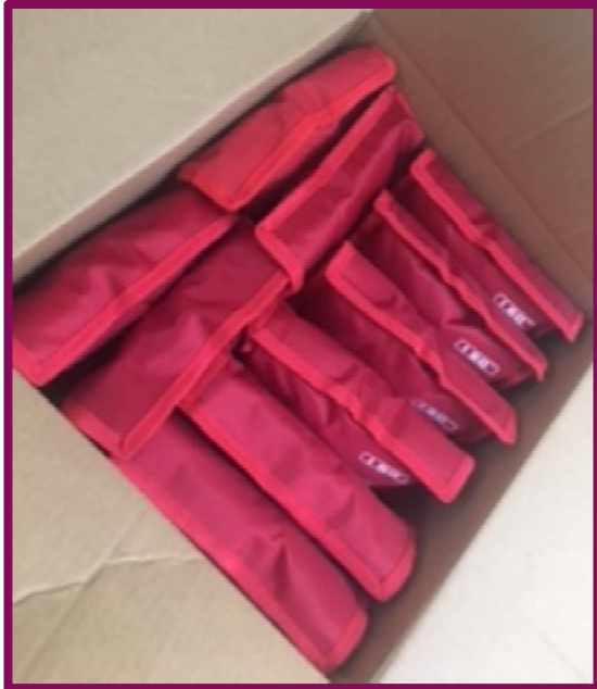
First Aid Kits