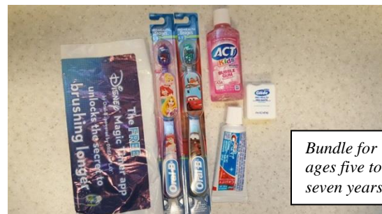
Bundle for ages five to seven years.