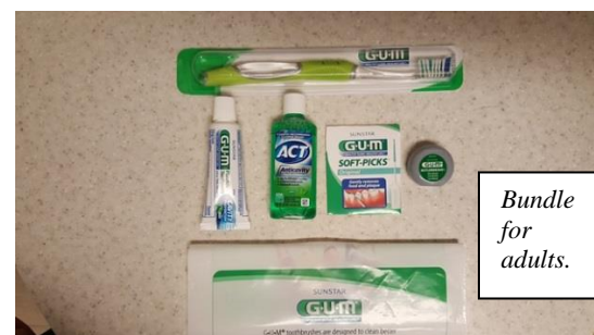
Bundle for adults.