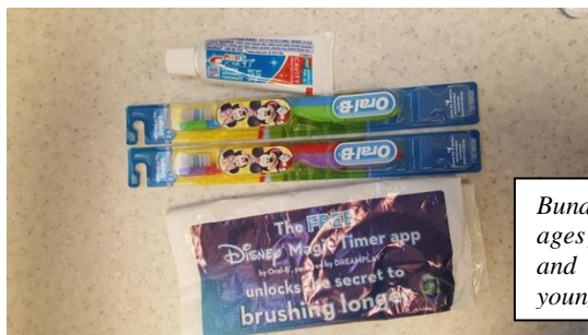
Bundle for ages four and younger.