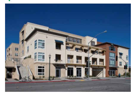
Delaware Pacific Apartments 10 Units