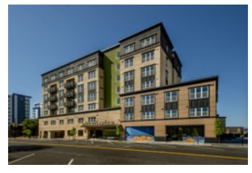
Arroyo Green Senior Housing 6 Units