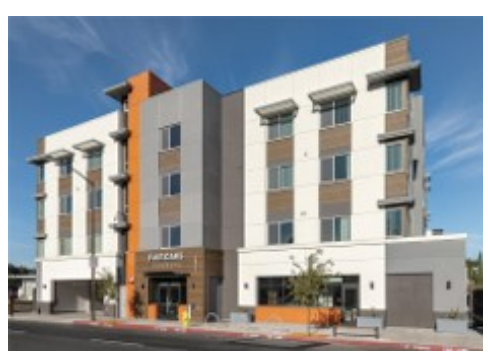
Fair Oaks Commons 6 Units

By mid-year 2026, 7 new housing developments will provide an additional 87 permanent and 29 transitional supported housing units in San Mateo County through MHSA funding, including 9 housing units via the <u>No Place Like Home</u> program, Governor Brown's landmark legislation to dedicate $2 billion in bonds paid from MHSA to fund permanent supportive housing.