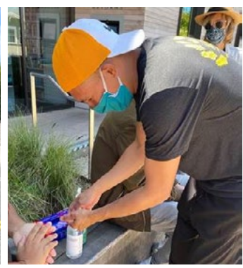
BHRS donated a supply of hand sanitizers to Ayudando Latinos A Soñar (ALAS) for their farmworker outreach workers who deliver food to families and farmworkers, and provide other home outreach services on the coastside.